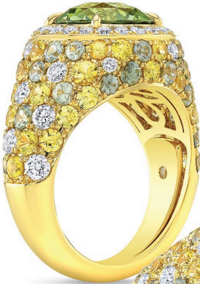
5.15ct Round Greenish-Yellow Sapphire Celebration Ring