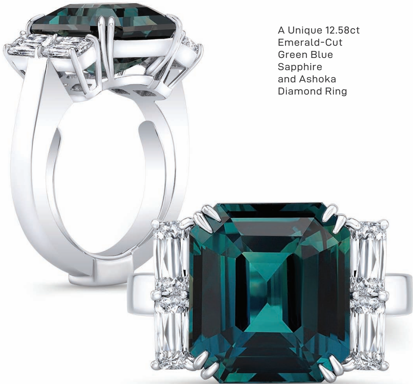
A Unique 12.58ct Emerald-Cut Green Blue Sapphire and Ashoka Diamond Ring