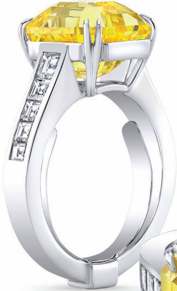
10.23ct Emerald-Cut Sun Yellow Sapphire Ring