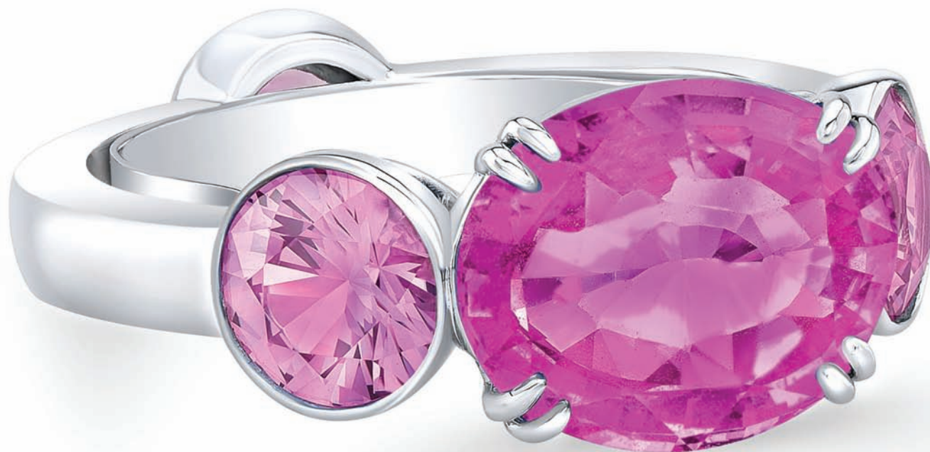
4.01ct Oval Vivid Pink Sapphire Ring and Round Pink Sapphire Ring