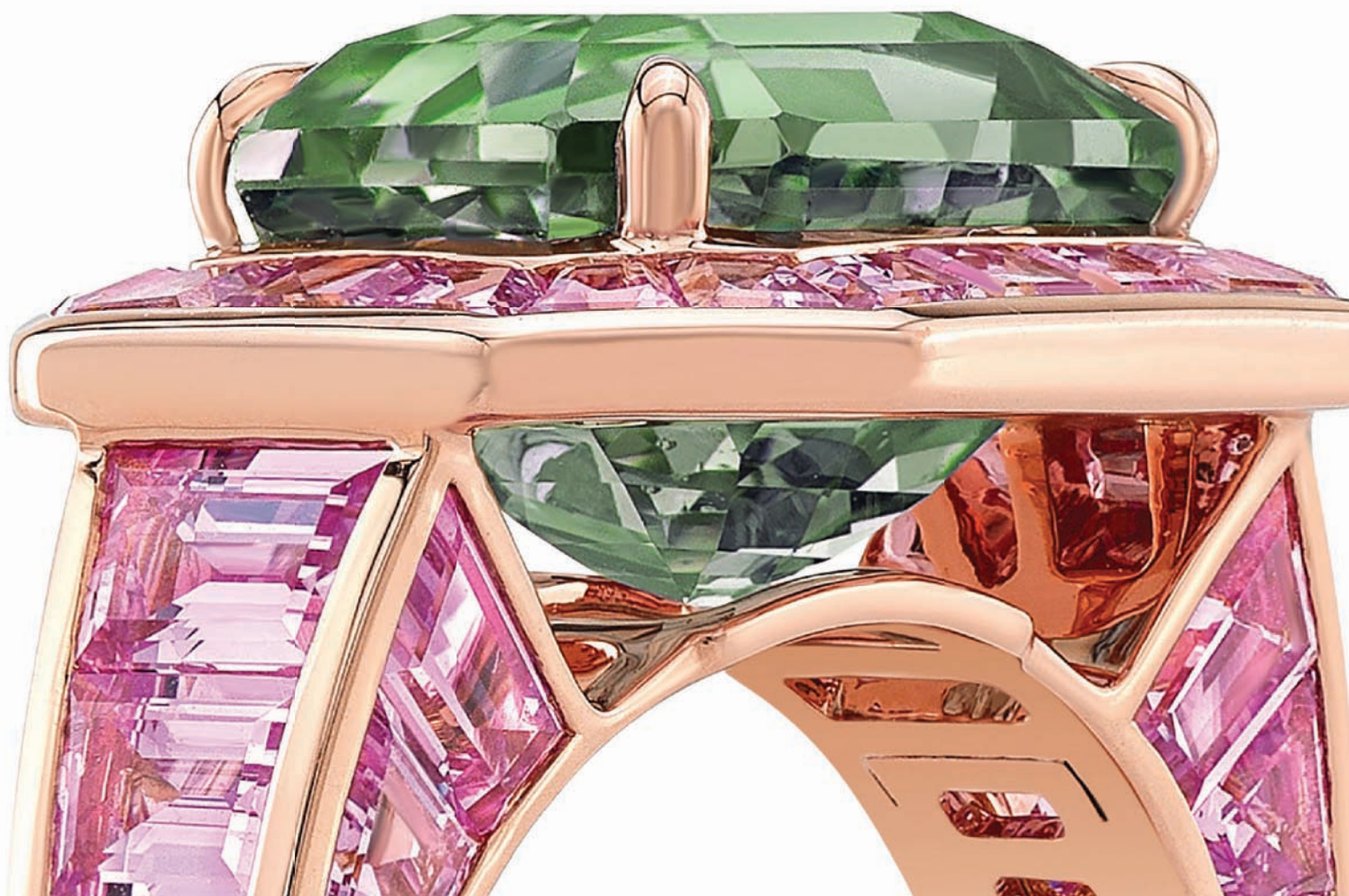
A Rare 8.65ct Color-Change Sapphire Masterpiece Ring