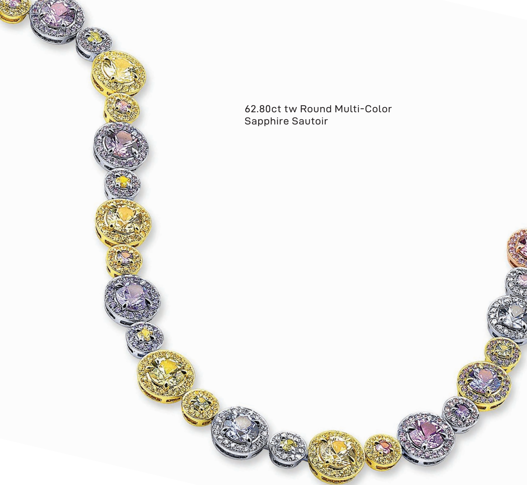
62.80ct tw Round Multi-Color Sapphire Sautoir