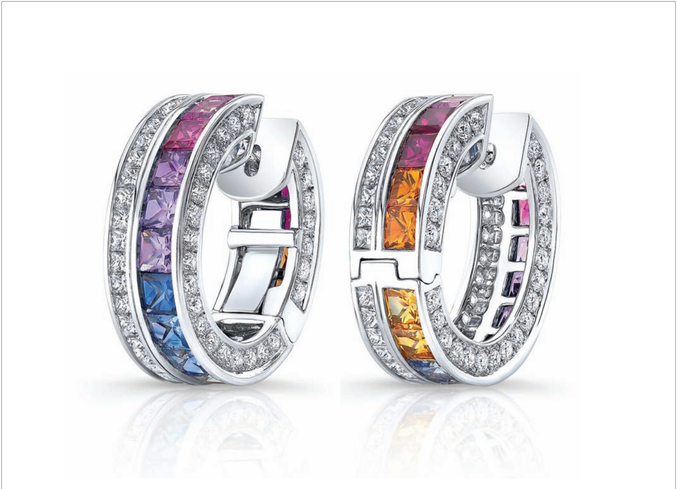
Multi-Color Gradation French-Cut Masterpiece Clutch Earrings