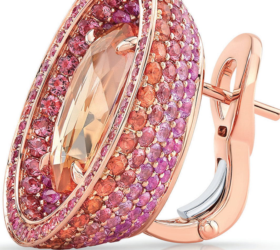
10.38ct tw Oval Padparadscha Luminous Earrings