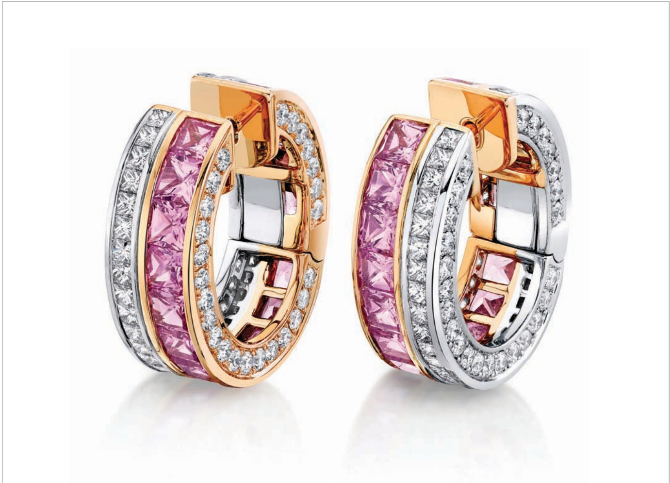
Pink Sapphire French-Cut Masterpiece Clutch Earrings