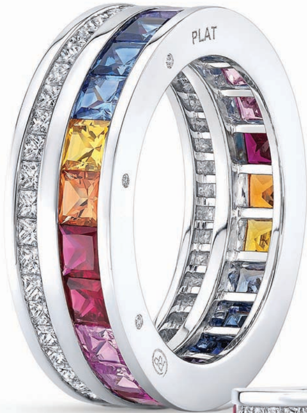
Multi-Color Gradation French-Cut Masterpiece Eternity Ring