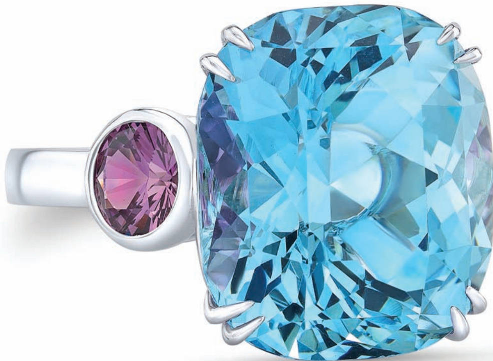
14.10ct Cushion Aquamarine and Round Pink Sapphire Ring