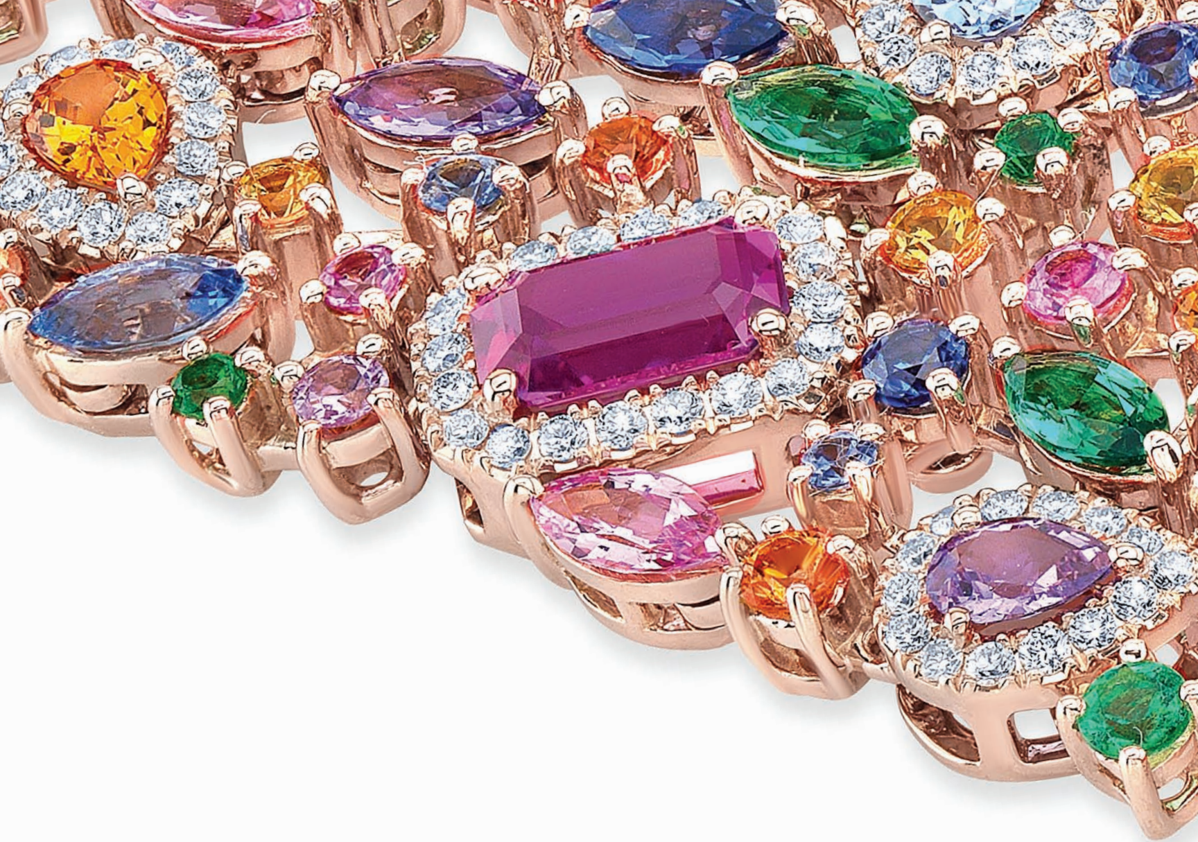
Multi-Color Sapphire Parisian Bracelet