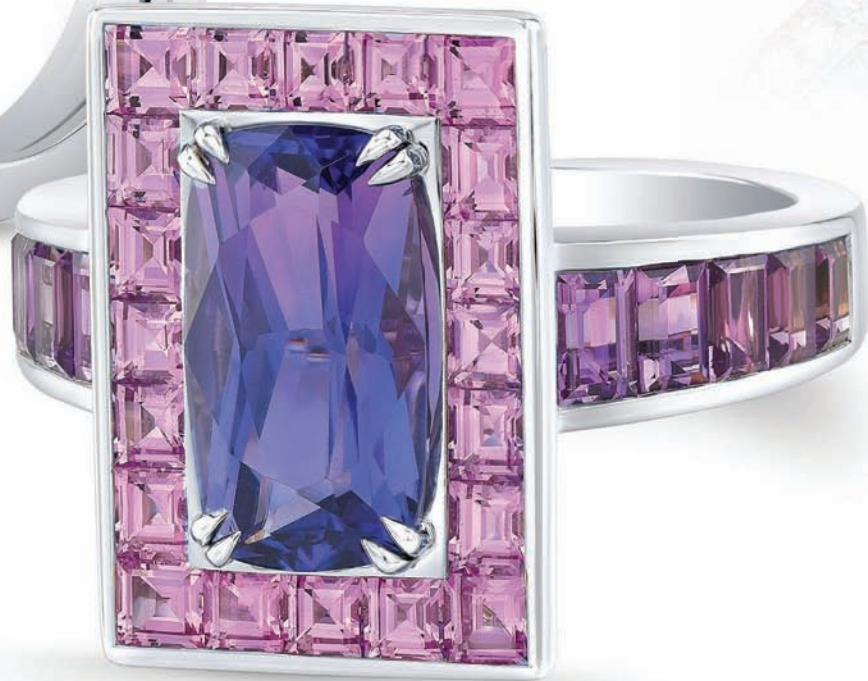
Bluish Violet changing to Purple Sapphire Masterpiece Ring