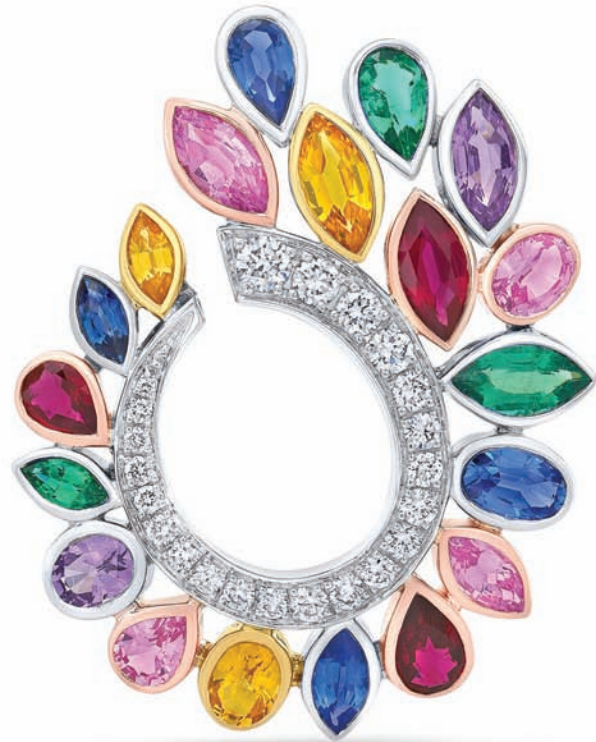
Multi-Color De La Vie Hoop Earrings