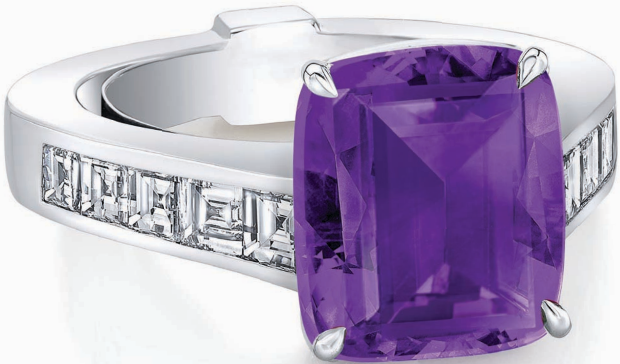
Purple Cushion Sapphire Ring