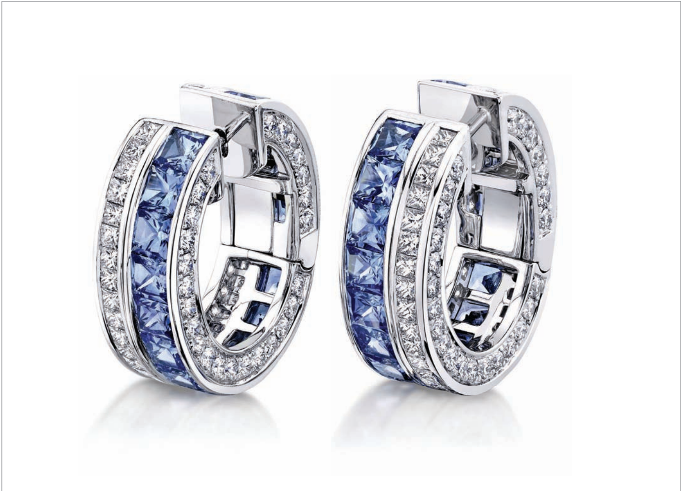
Blue Sapphire Masterpiece Clutch Earrings