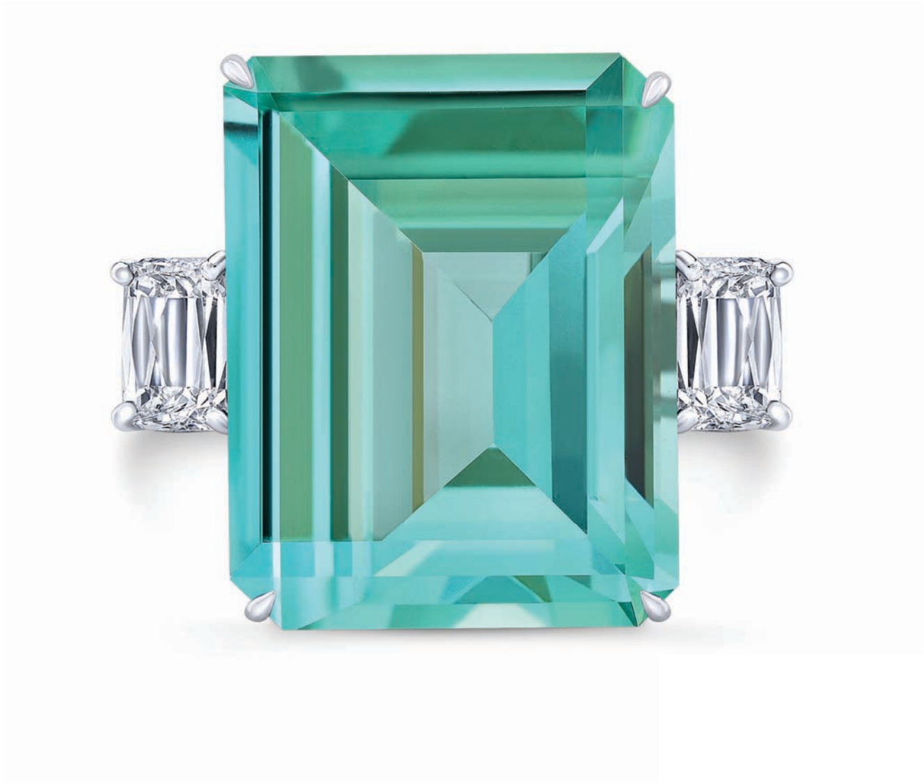
19.77ct Unique Cut Lagoon Green Tourmaline Ring