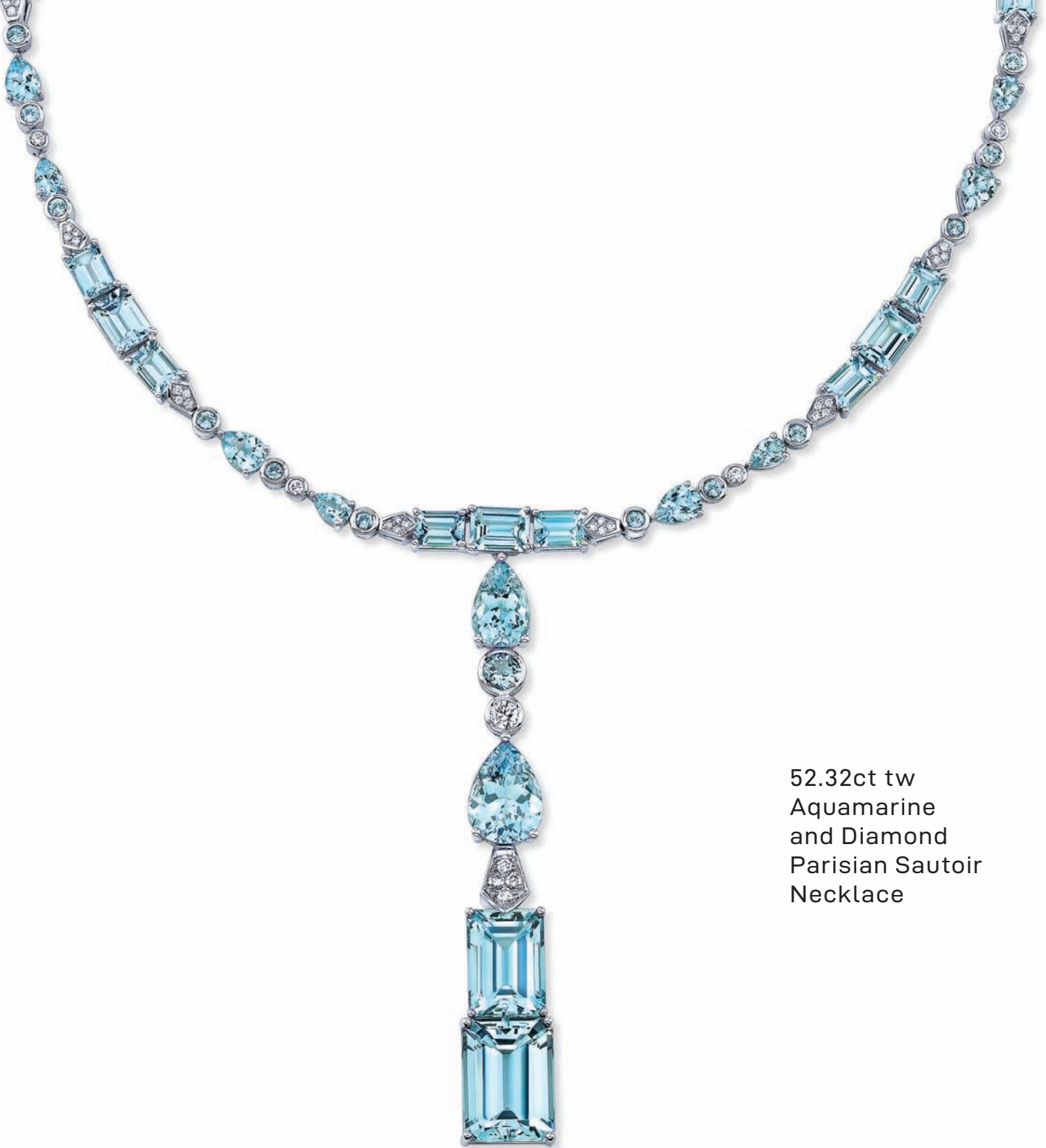
52.32ct tw Aquamarine and Diamond Parisian Sautoir Necklace