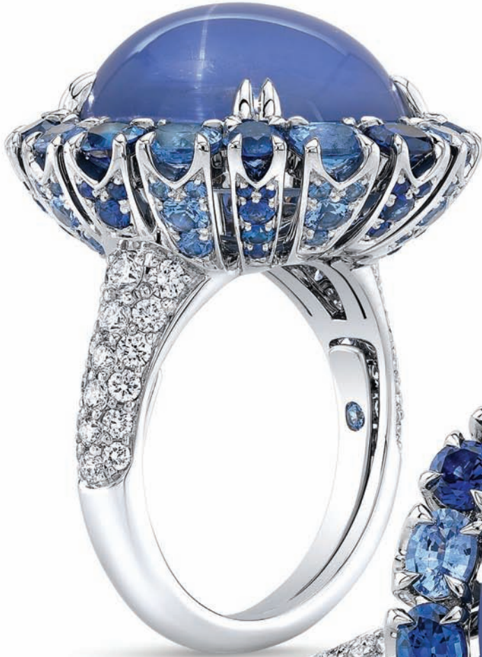
26.90ct Rare Gem Blue Star Sapphire Celebration Ring