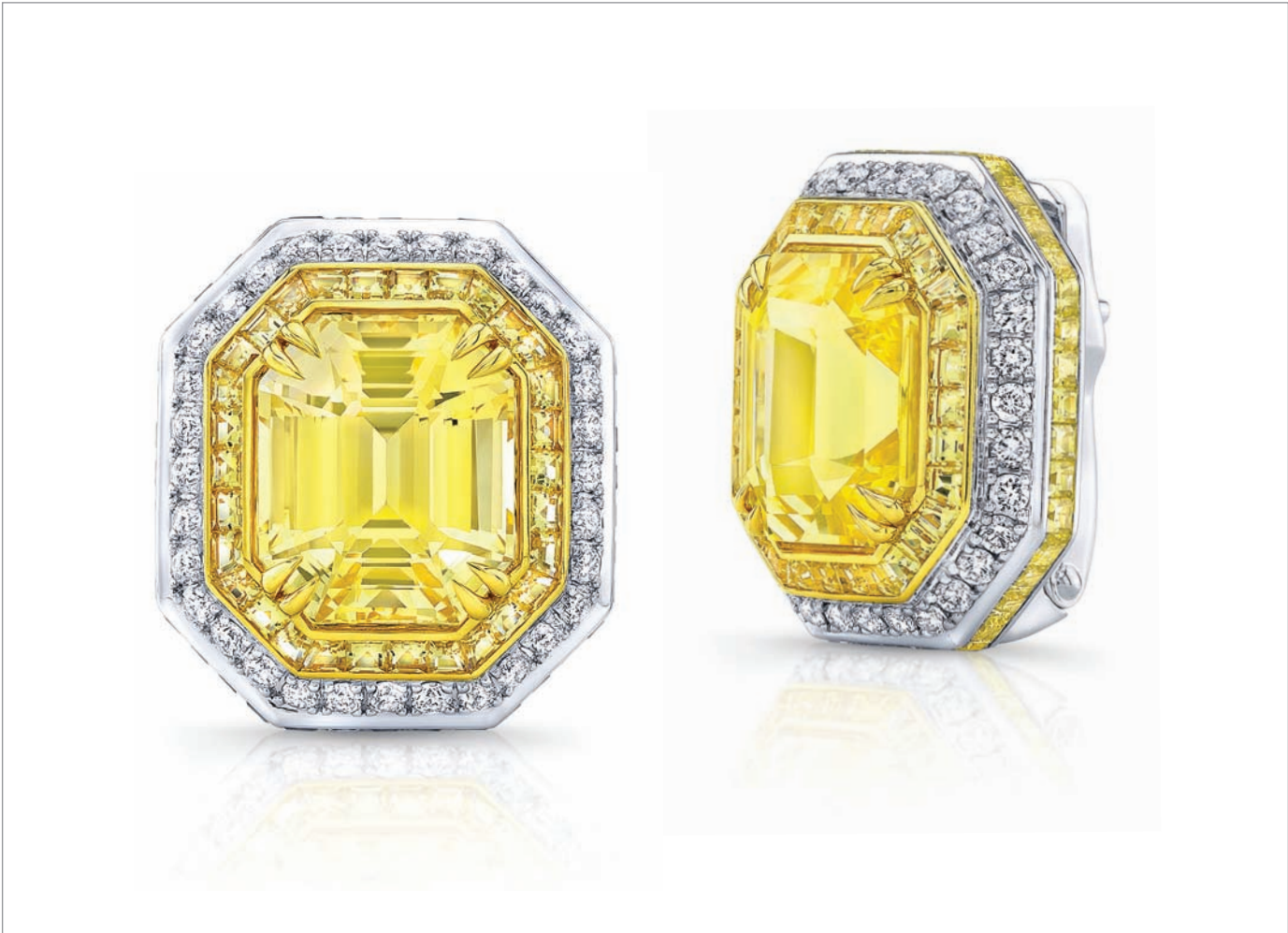
11.90ct tw Emerald-Cut Sun Yellow Sapphire Earrings