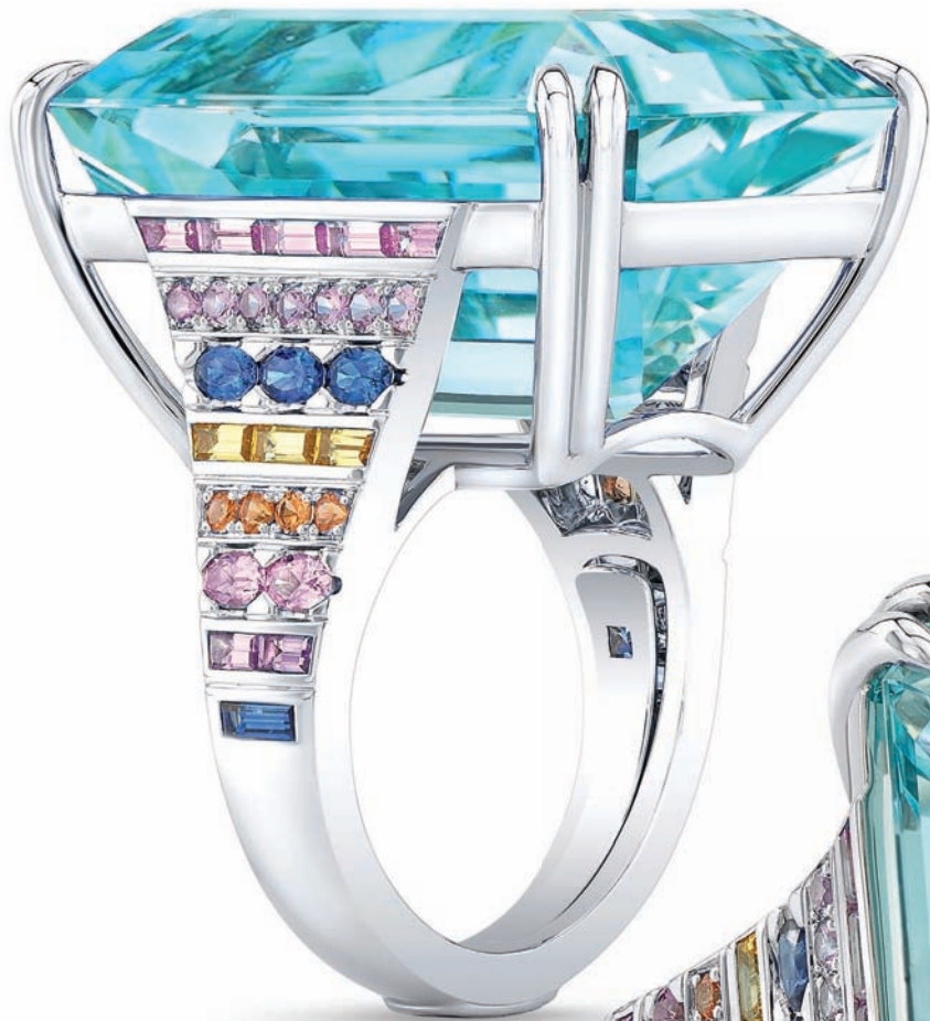
A Sea Blue 58.71ct Emerald-Cut Aquamarine Ring