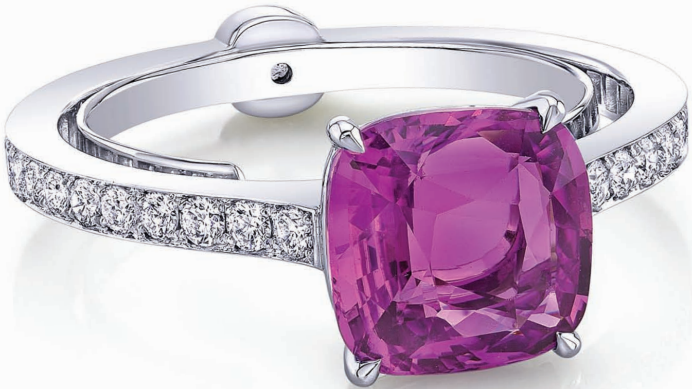
Cushion Purplish Pink Sapphire Ring