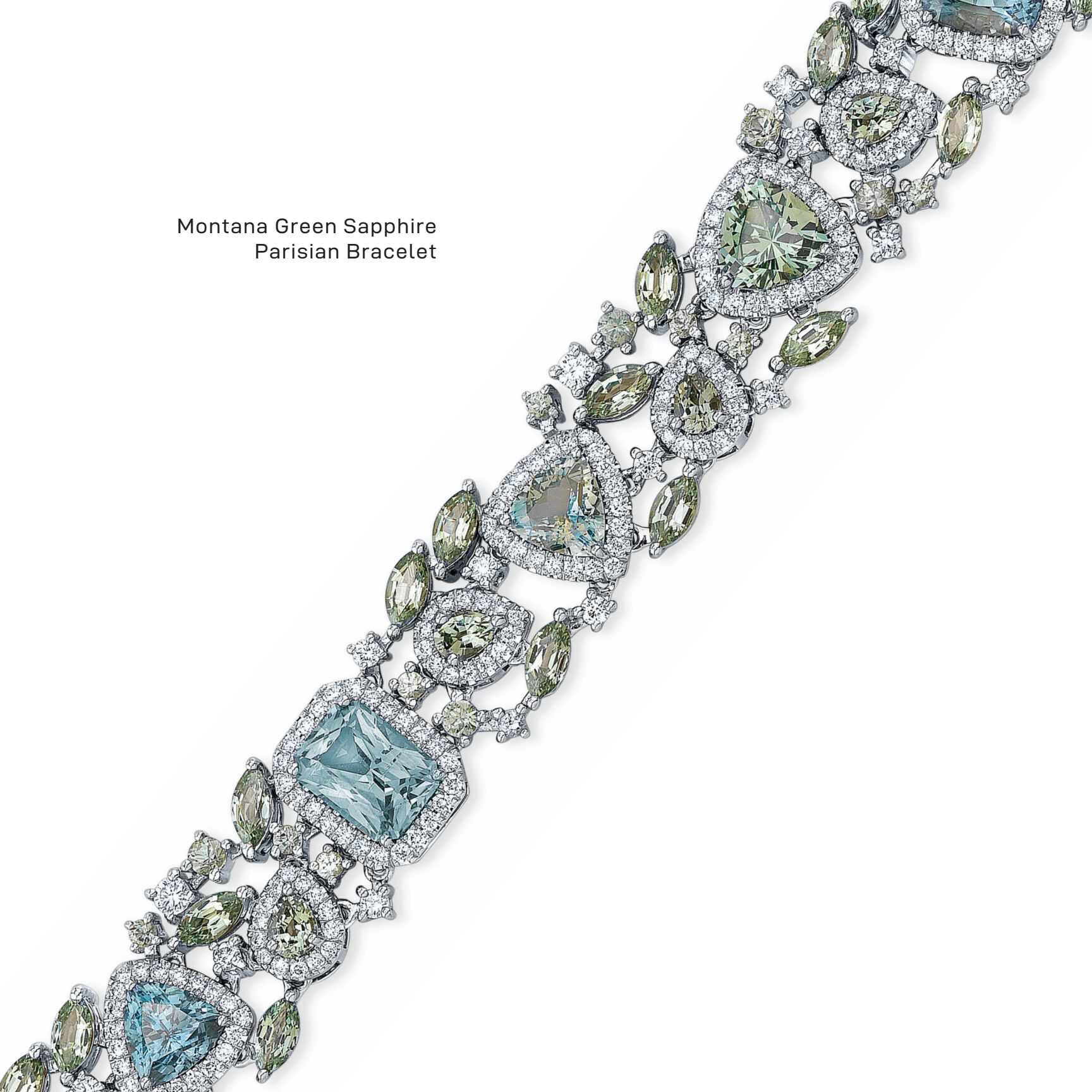
Montana Green Sapphire Parisian Bracelet