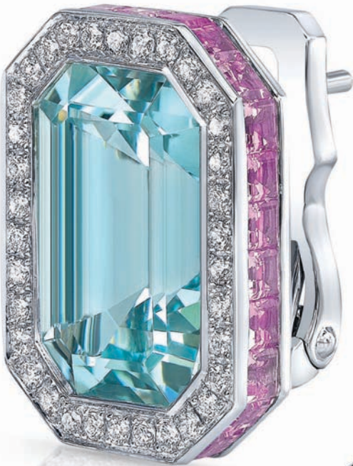
Aquamarine and Sapphire Masterpiece Earrings