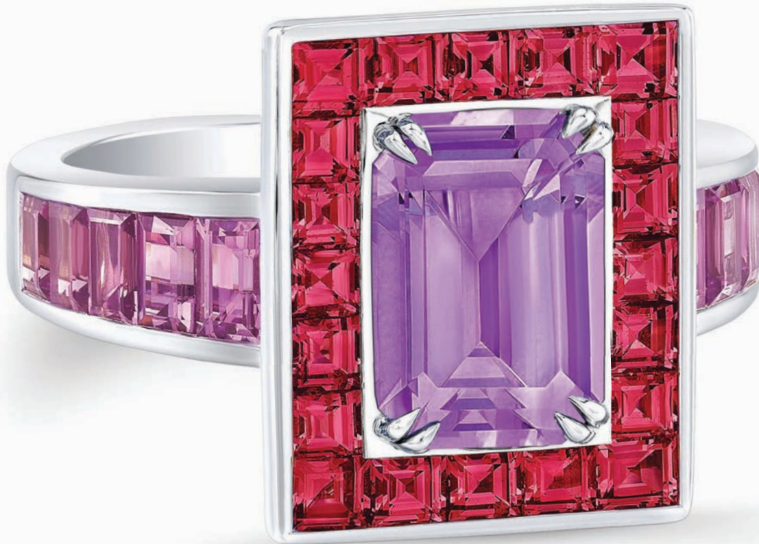
Emerald-Cut Purple Sapphire Masterpiece Ring