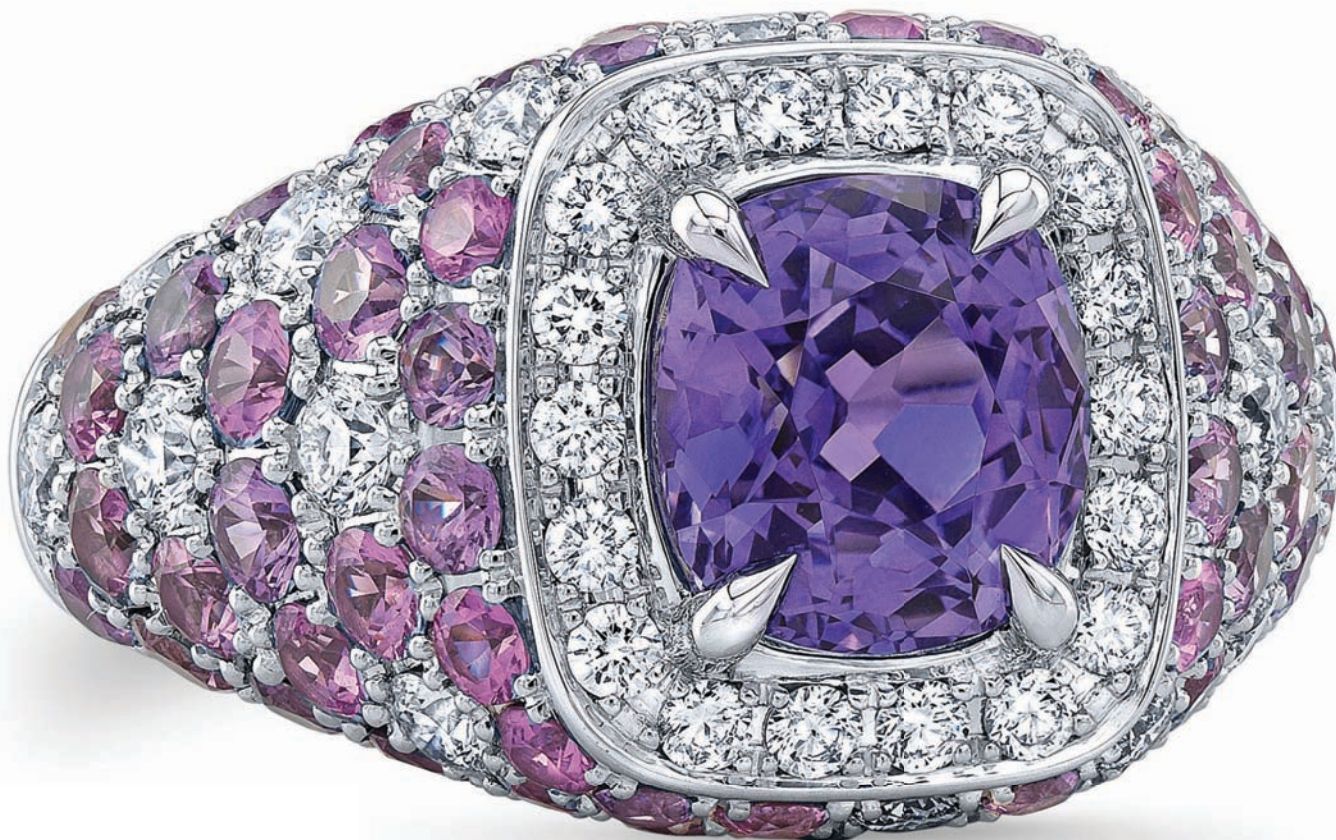
Purple-Violet Cushion Sapphire Celebration Ring