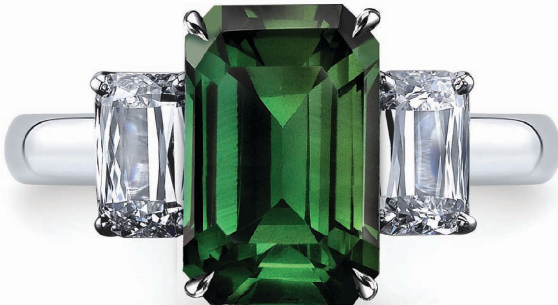
4.56ct Emerald-Cut Green Sapphire and Ashoka Diamond Ring