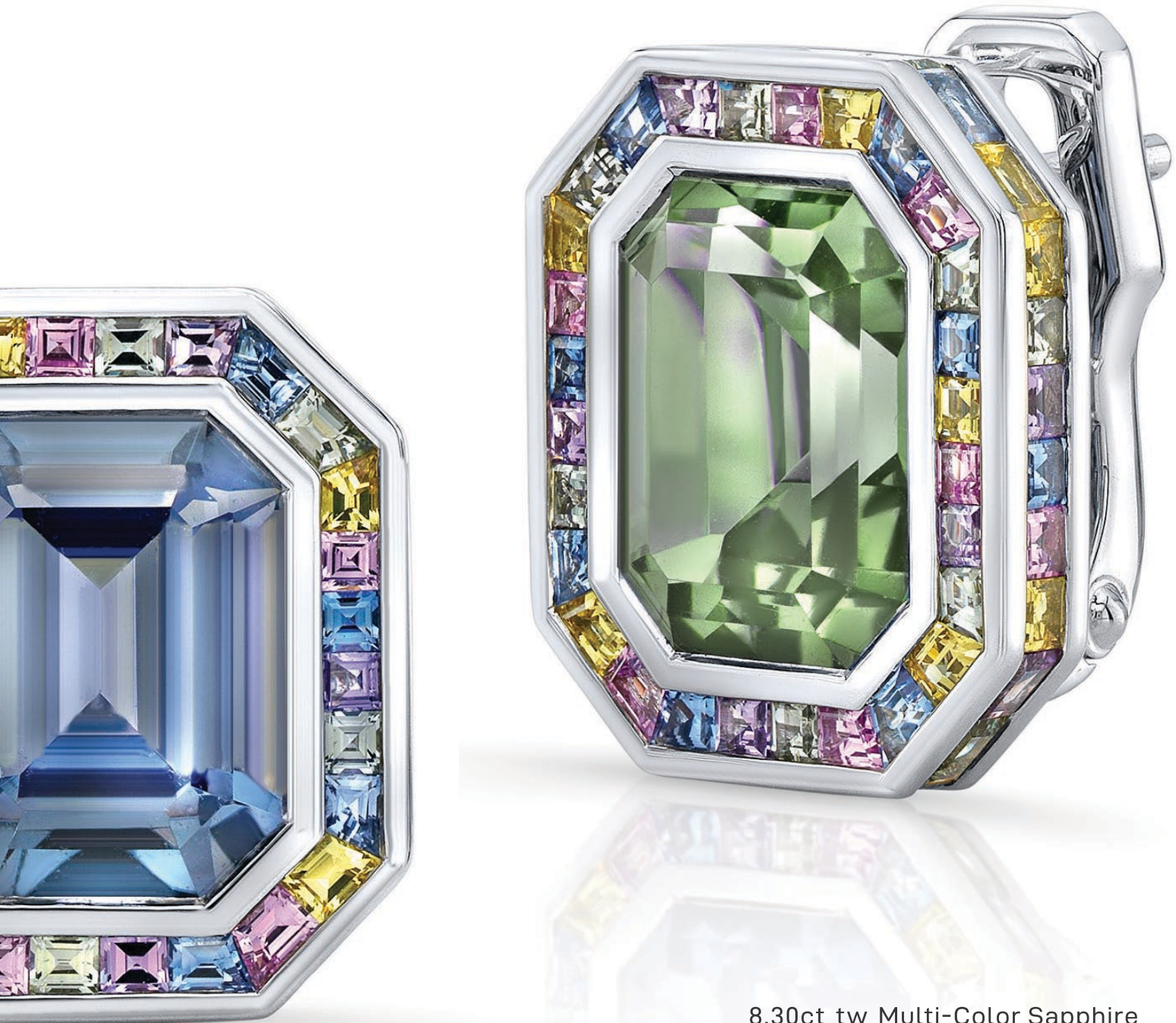
8.30ct tw Multi-Color Sapphire Masterpiece Earrings